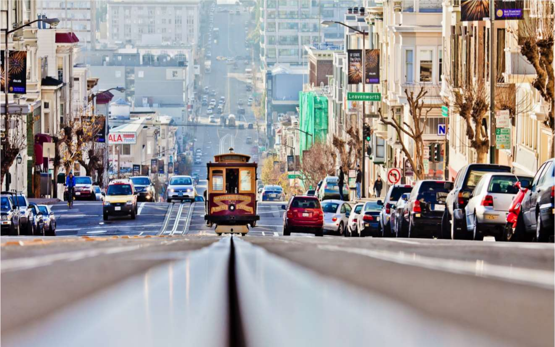
San Francisco, California