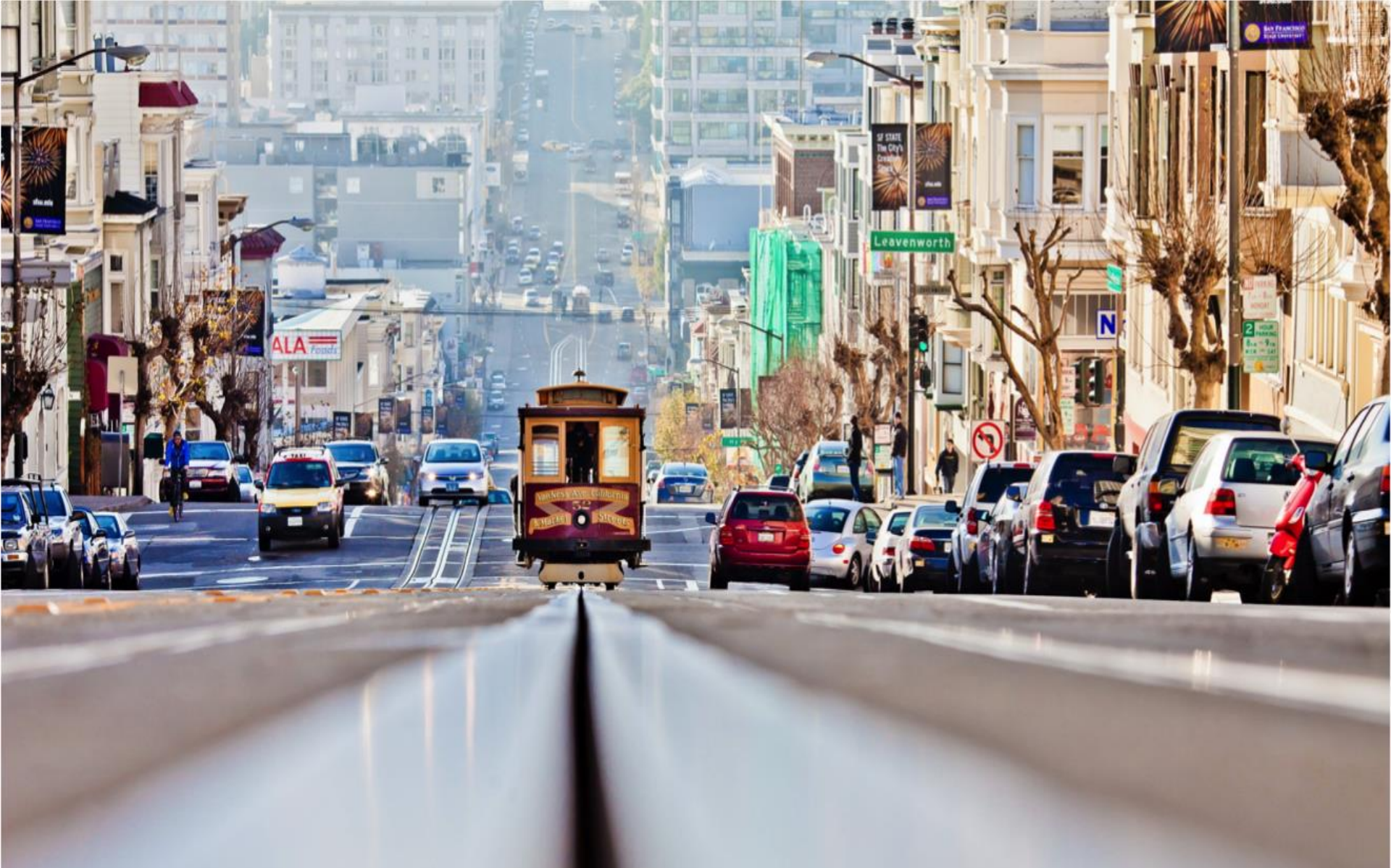
San Francisco, California