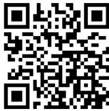
[Paul Rusch Athletic Center]